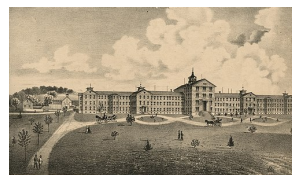
St. Peter State Hospital, 1874 lithograph