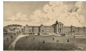
St. Peter State Hospital, 1874 lithograph