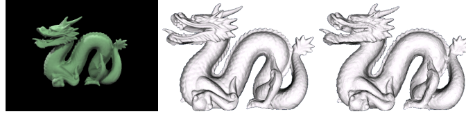
Figure 3: Synthesized dragon sequence. From left to right : 1 of 32 diffuse input images; ground truth model; recovered shape by our algorithm;