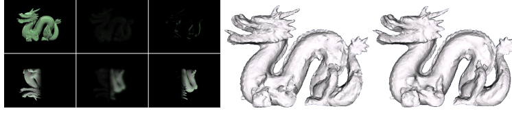
Figure 5: Dragon sequence synthesized with specular reflectance model and occlusions. From left to right : 2 of 32 input images; recovered corrective images; ground truth corrective images; recovered shape without the corrective model; recovered shape with the corrective model.