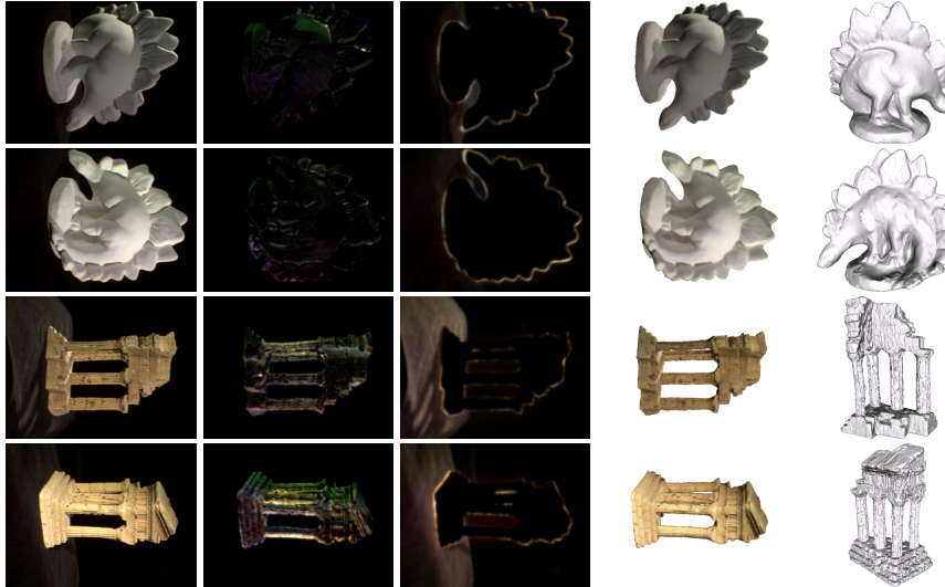
Figure 6: Dino and Temple sequence. From left to right: 1 of 16 input images; estimated non-Lambertian component (scaled by 8 for visualization); estimated background images (scaled by 2 for visualization); estimated radiance; estimated mesh seen from a different viewpoint.

lower part which might be due to some photometric camera bias as it appears in all images.