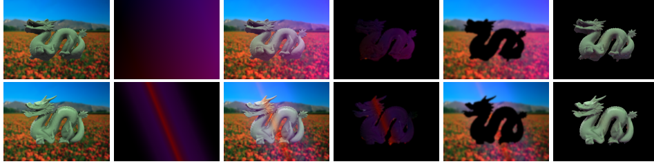
Figure 4: Synthesized dragon sequence. From left to right : 2 of 32 original images; components added for simulating the photometric camera effects; input images; estimated corrective component (scaled by 2 for visualization); estimated background images; estimated shape and radiance.

images. The result shows the correct reconstruction of the dragon, even though the texture is smooth and some parts in shadow are dark (See Tab. 1).